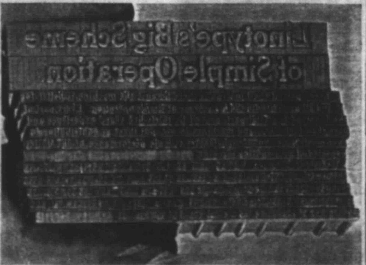
THE LINOTYPE SLUG, being solid, is handled more easily than hand-assembled type, made up of many small pieces.

HOSPITAL VISITORS' GUIDE Your hospital's responsibility is to provide and render medical care when needed. This, of course, is accomplished by a group of people dedicated to the medical profession, striving to make residents in the hospital as comfortable and pleasant as possible. The hospital staff can best fulfill its mission when you cooperate as follows: 1. Compliment with the posted visiting hours. 2. Making your visit short—five to ten minutes at most. The patient will probably have other visitors. 3. Not having more than two visitors per patient at a time. 4. Being polite and courteous in your problems with the hospital. 5. Not smoking in patients' rooms. 6. Not sitting on patients' beds. 7. Not smoking in bed (this could be hazardous). 8. Leaving children 15 years or under at home. 9. Talking in a low, soft voice, as other patients will not be disturbed. It is a proven fact that when patients have an excessive amount of visitors, hospital stays can be prolonged by one to three days. If you follow the few suggestions above, then you will become a good hospital visitor. —Lauderdale County Hospital